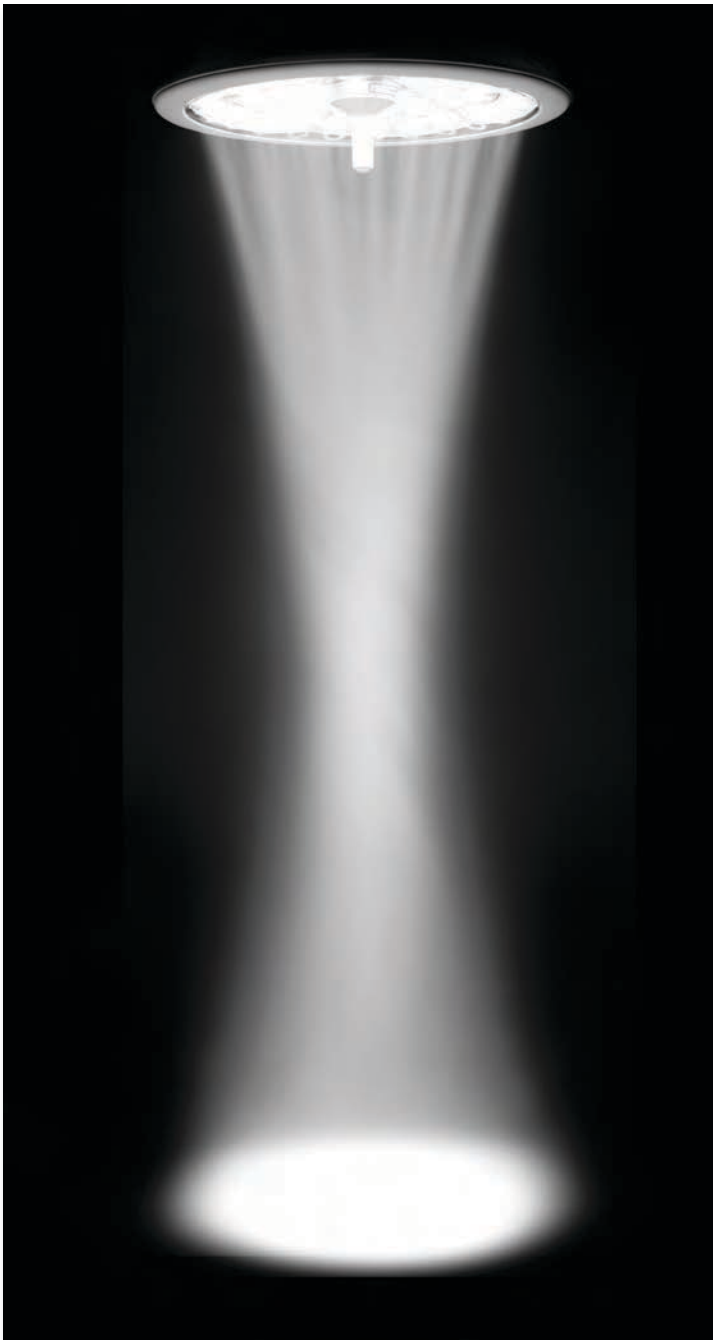
Actual photograph of System Two LED light output.

Medical Illumination International products are sold through medical equipment distributors, worldwide. Please contact us for referral to a distributor in your region.